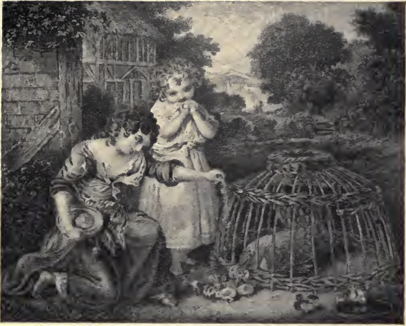
Children of the Cottage